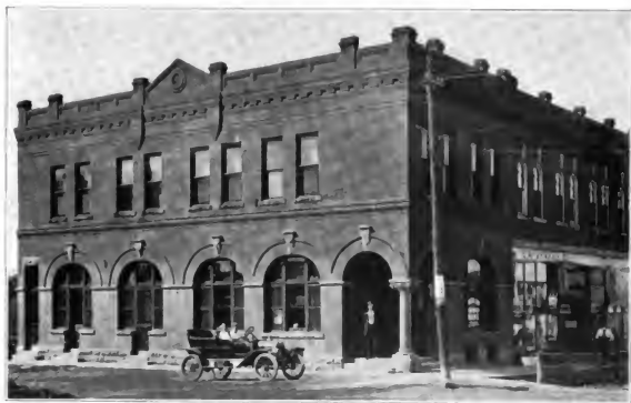
CRYSTAL LAKE SAVINGS BANK